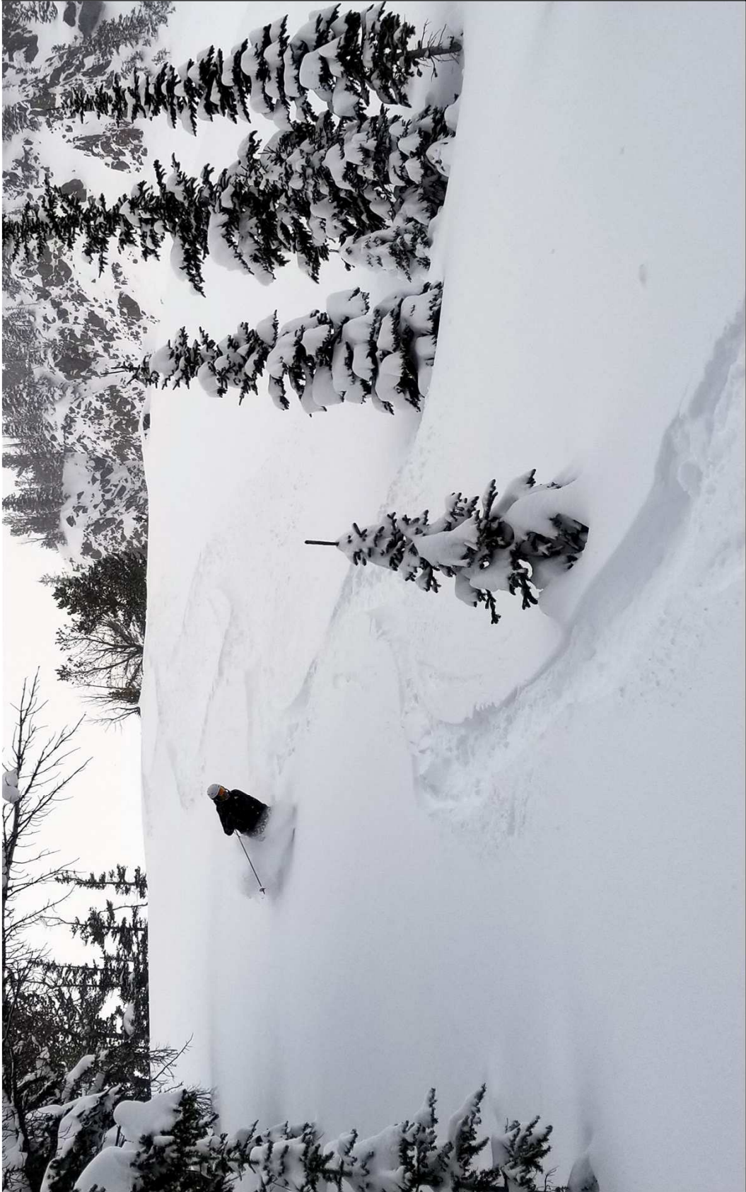
Skiing Palace Butte